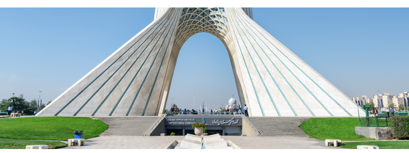
(Efired / Shutterstock)